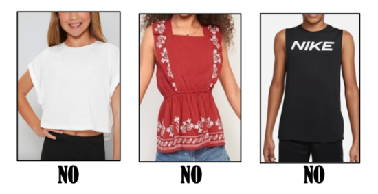
and sleeveless shirts