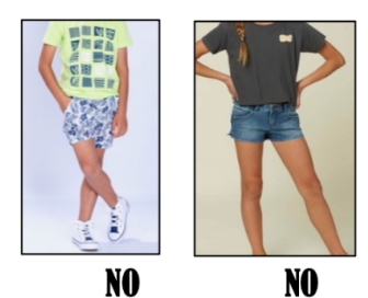
Shorts must come below fingertips.