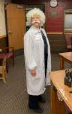
Thank you to our students for helping us recognize positive, courageous, brave, wise & kind role models.